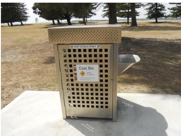
Shown with client's custom signage

Available in this range: EM225 with single chute