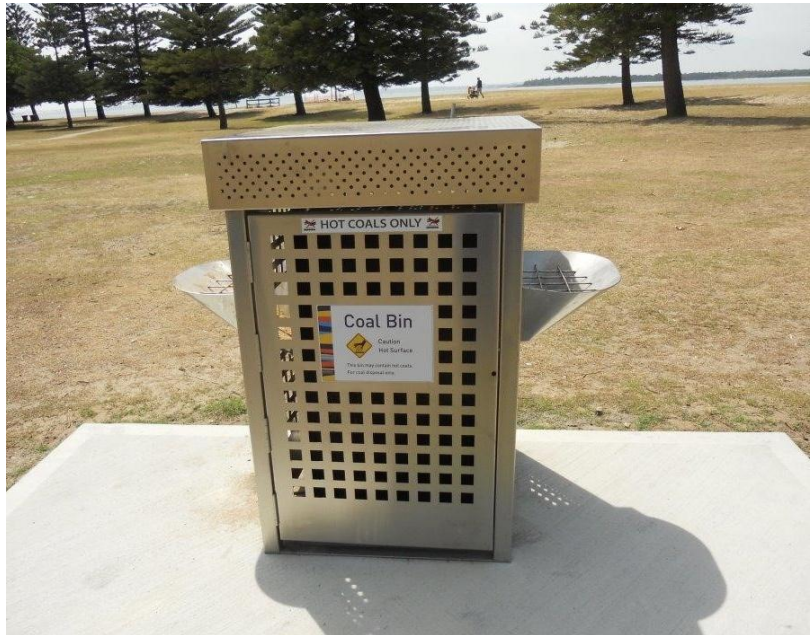
Shown with client's custom signage

For the disposal of hot charcoal bricks in parks and public venues.